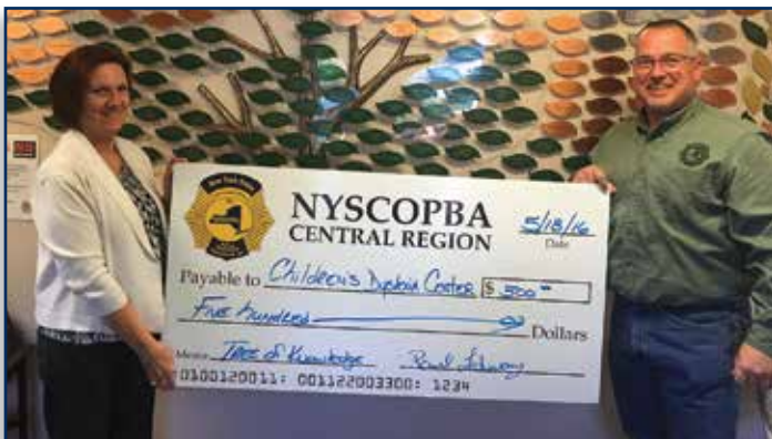
Central Region gives a $500 donation to The Children's Dyslexia Center CNY