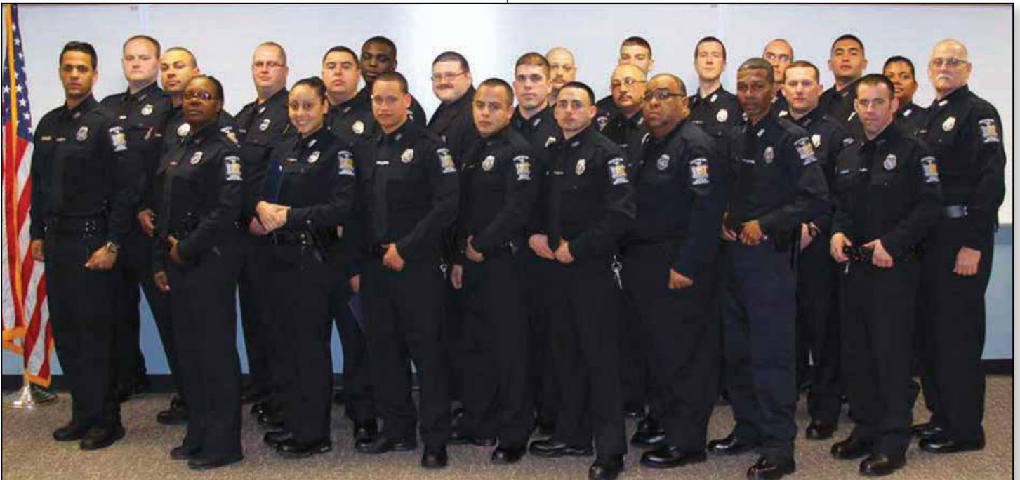
NYS OMH Safety Officer Academy Graduation, March 25, 2016