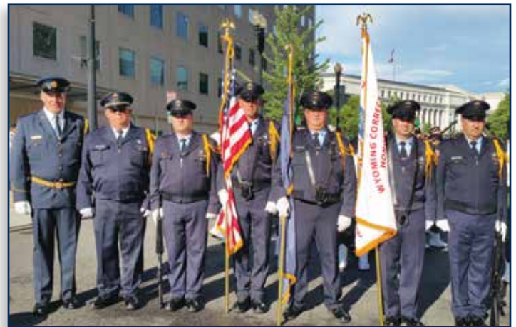
Wyoming CF Color Guard