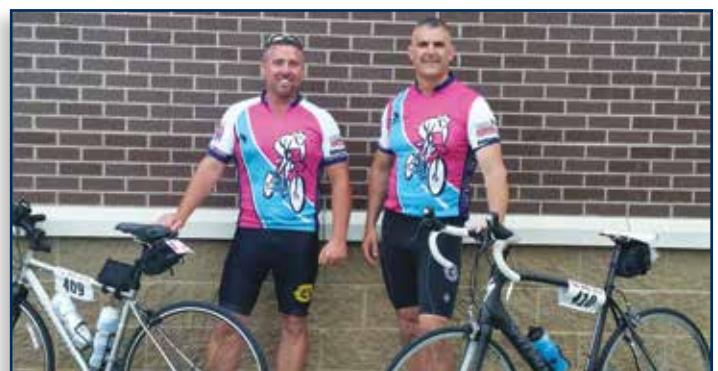
The Ride For Missing and Exploited Children was on June 3rd 2016