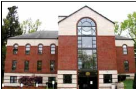
NYSCOPBA's Office on 102 Hackett Blvd.

Published by: The New York State Correctional Officers & Police Benevolent Association, Inc. 102 Hackett Blvd., Albany, NY 12209 - (518) 427-1551/(888) 484-7279 www.nyscopba.org - nyscopba@nyscopba.org Circulation: 27,000