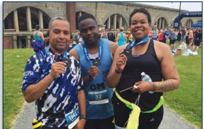
Members of the Sing Sing Run Club participated in the Newport News 10 Miler in Rhode Island