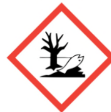
GHS09 Environmental Hazard