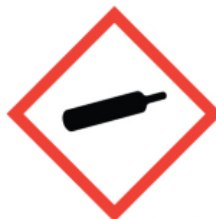
GHS04 Compressed Gas