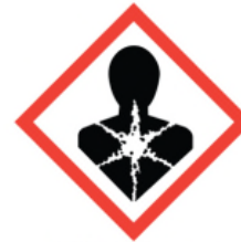
GHS08 Health Hazard